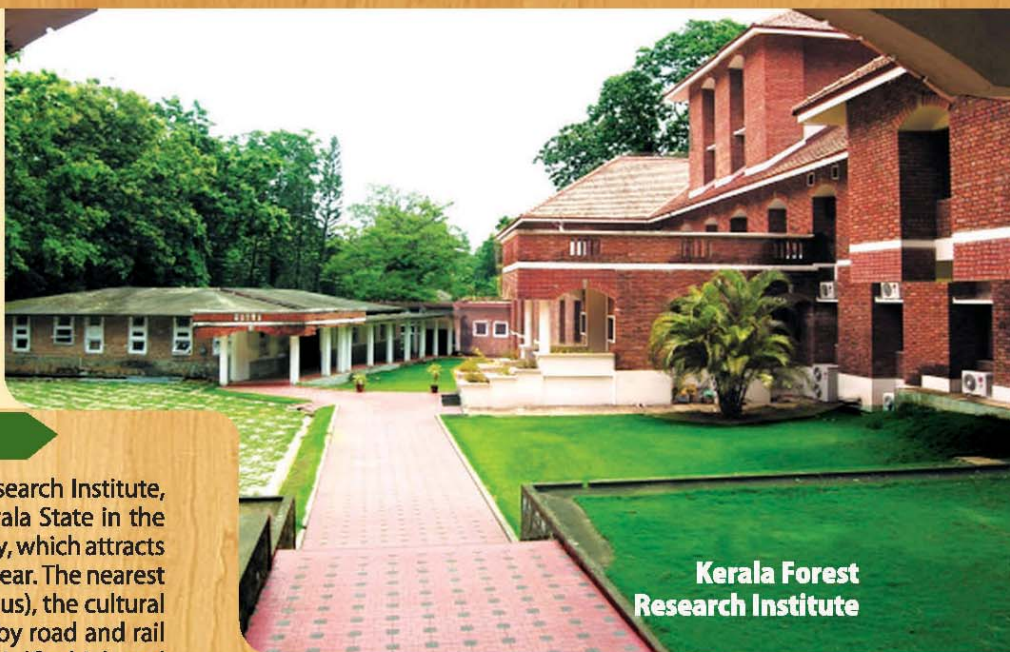
Kerala Forest Research Institute